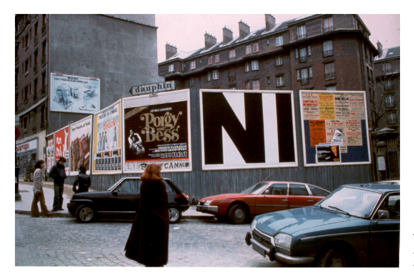
Tania Mouraud, City performance N°1, 1977, Pigment ink on Fine art paper 0 Tania Mouraud, by courtesy of Ceysson & Bénétière & Studio Mouraud