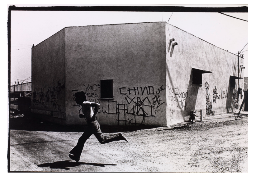
Gusmano Cesaretti, Chaz Running : a back street near Whittier Boulevard ; East Los Angeles, 1973, photograph © Gusmano Cesaretti