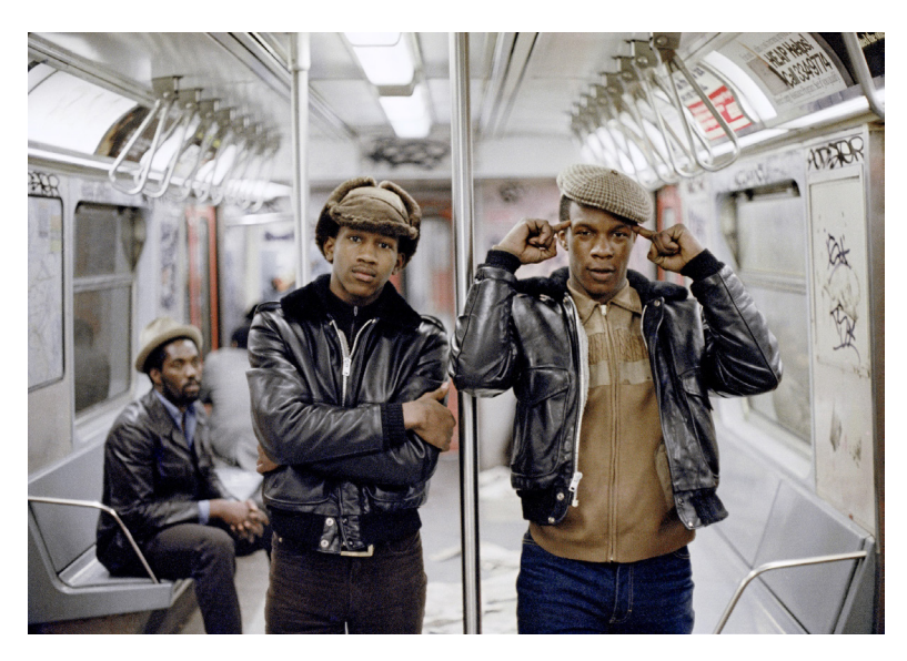
Jamel Shabbaz, The Righteous Brothers, NYC 1981 Chromogenic, 28 x 35 cm